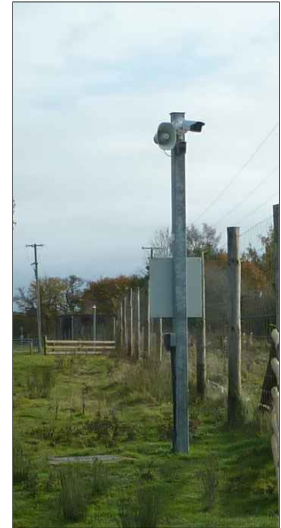
CCTV on adjacent site